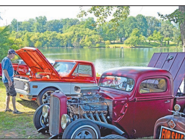
Beautiful trucks on Lake Chatuge.

Whether you are a fan of classic hot rods, vintage rat rods, or contemporary