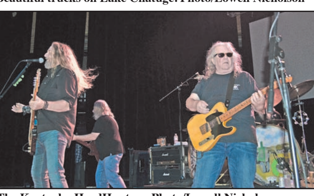
The Kentucky HeadHunters.